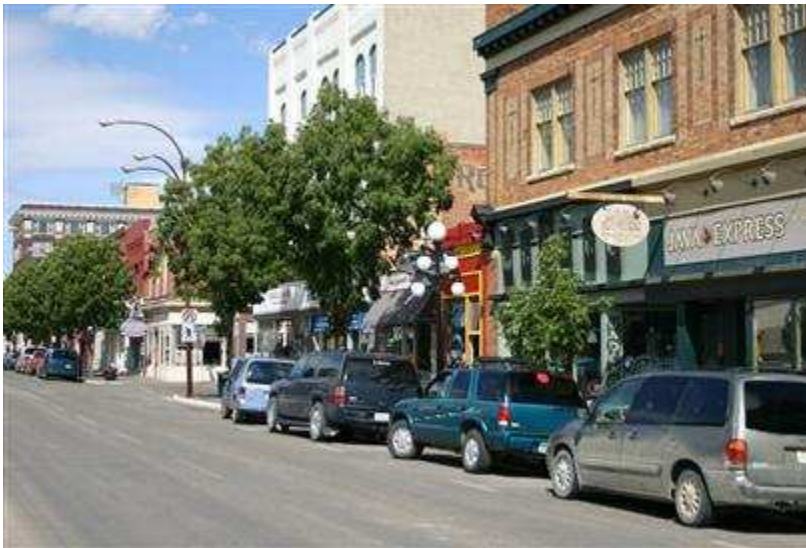
Downtown Moose Jaw